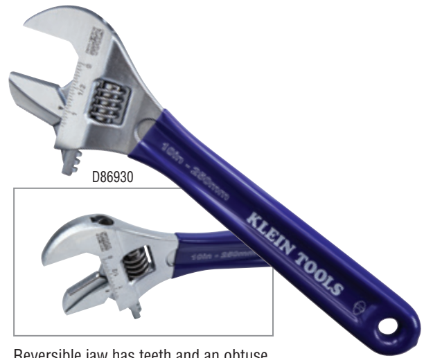
Reversible jaw has teeth and an obtuse angle to work as a pipe wrench