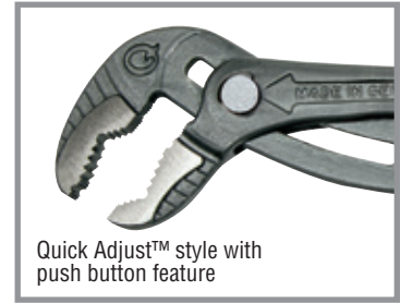
Quick Adjust™ style with push button feature